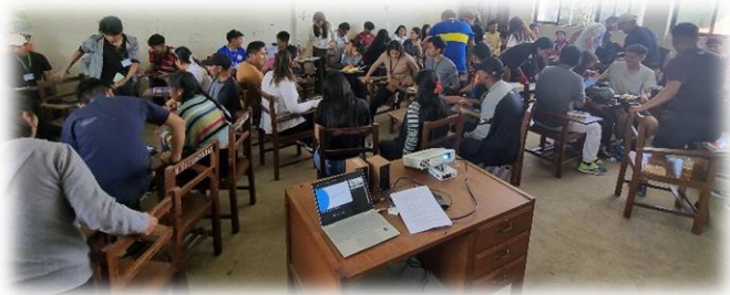
Break out groups in our workshop with Jovenes

We often have the opportunity to speak at interesting events and these past months were no exception.